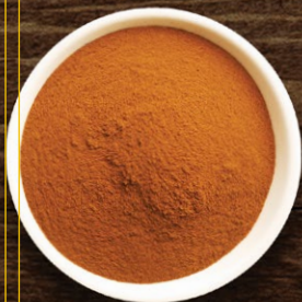
¼ tsp. cinnamon