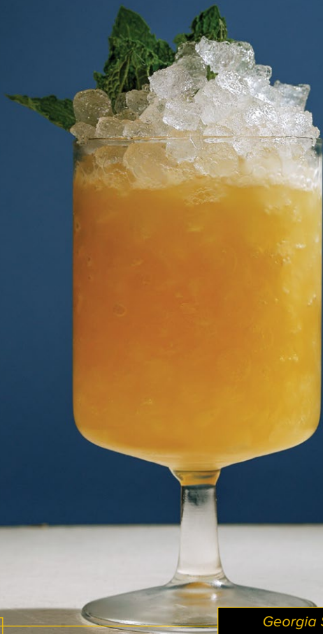
Georgia Smash 9