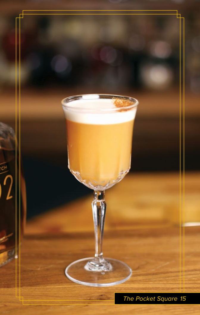
The Pocket Square 15