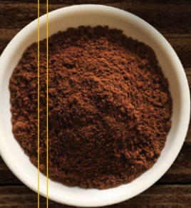
Pinch of allspice