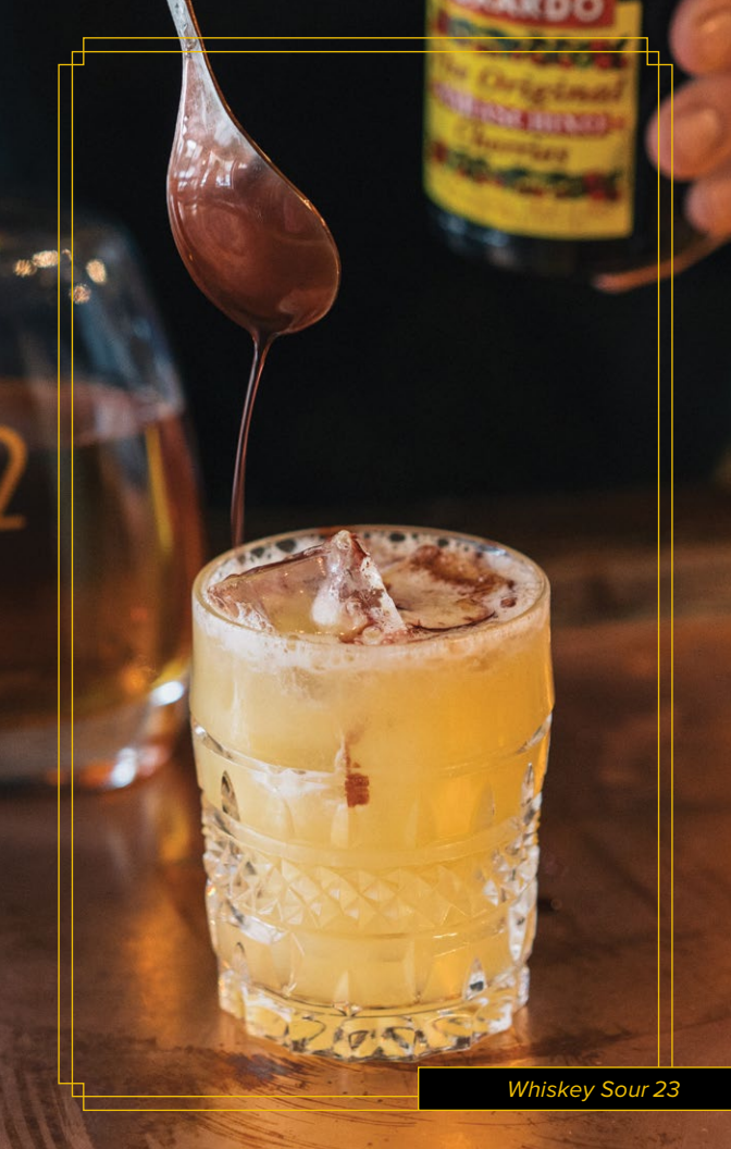
Whiskey Sour 23