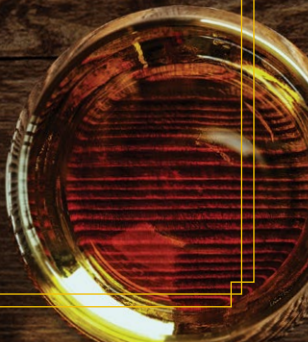
8 oz. 1792 Bourbon