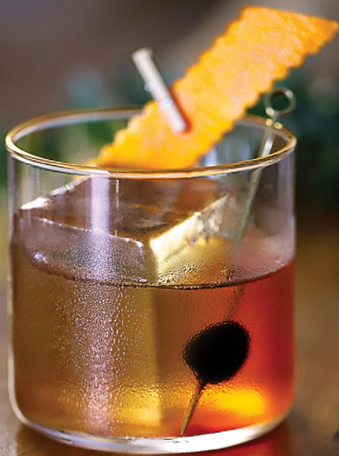
Old Fashioned 13